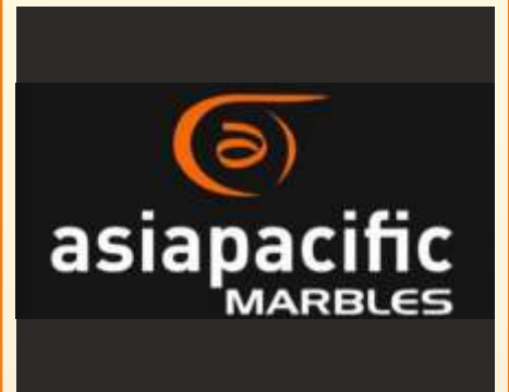
Rtn. Saurabh Agarwal